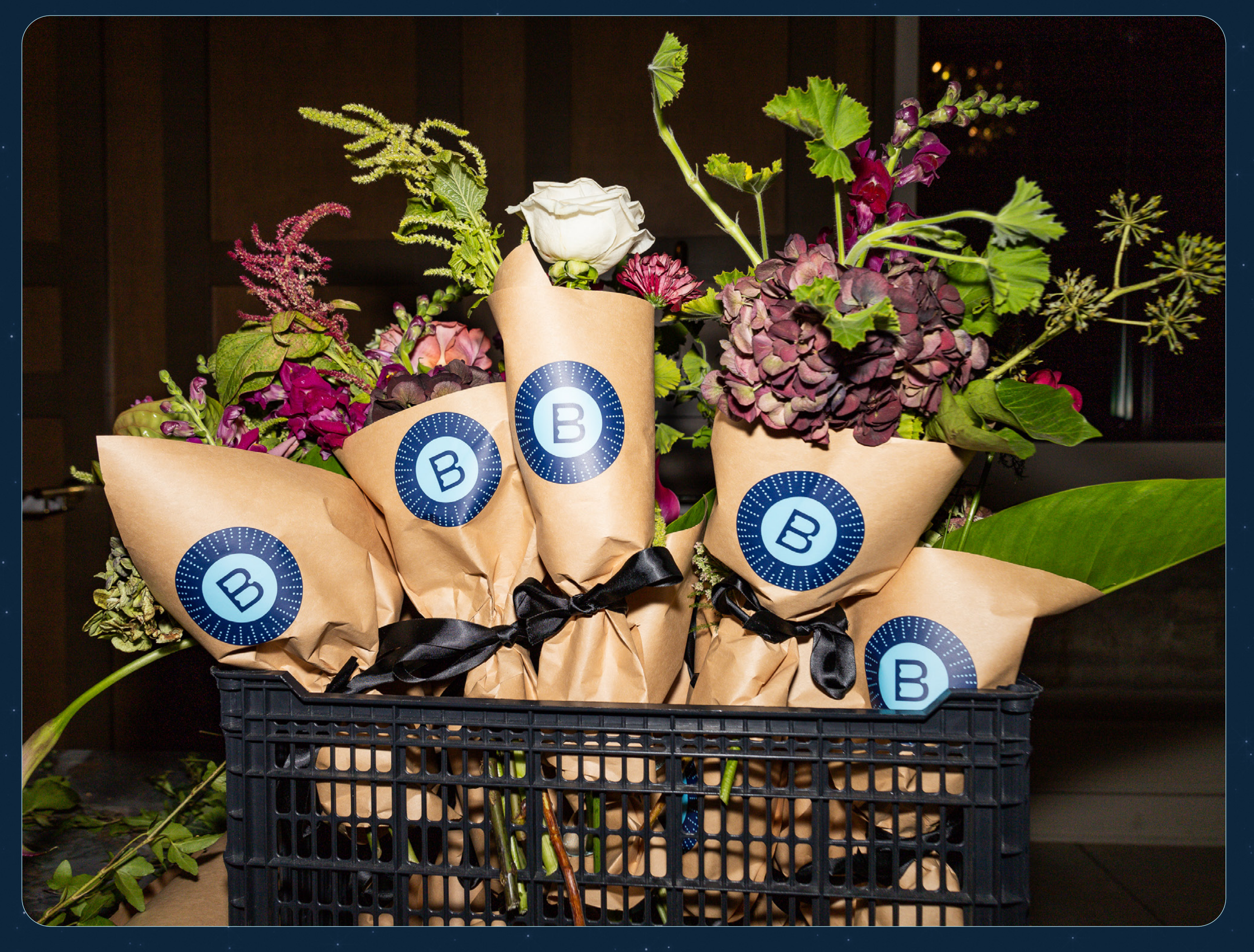
2024 Luminary Gala Attendee Gift: Floral Arragement by Botanic Village

We welcome in-kind sponsorship inquiries and look forward to discussing options should your business be interested in any of above-mentioned services or products, or services and products not listed above.