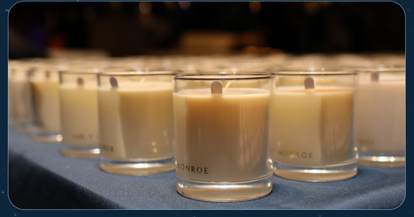
2024 Lüminary Gala.