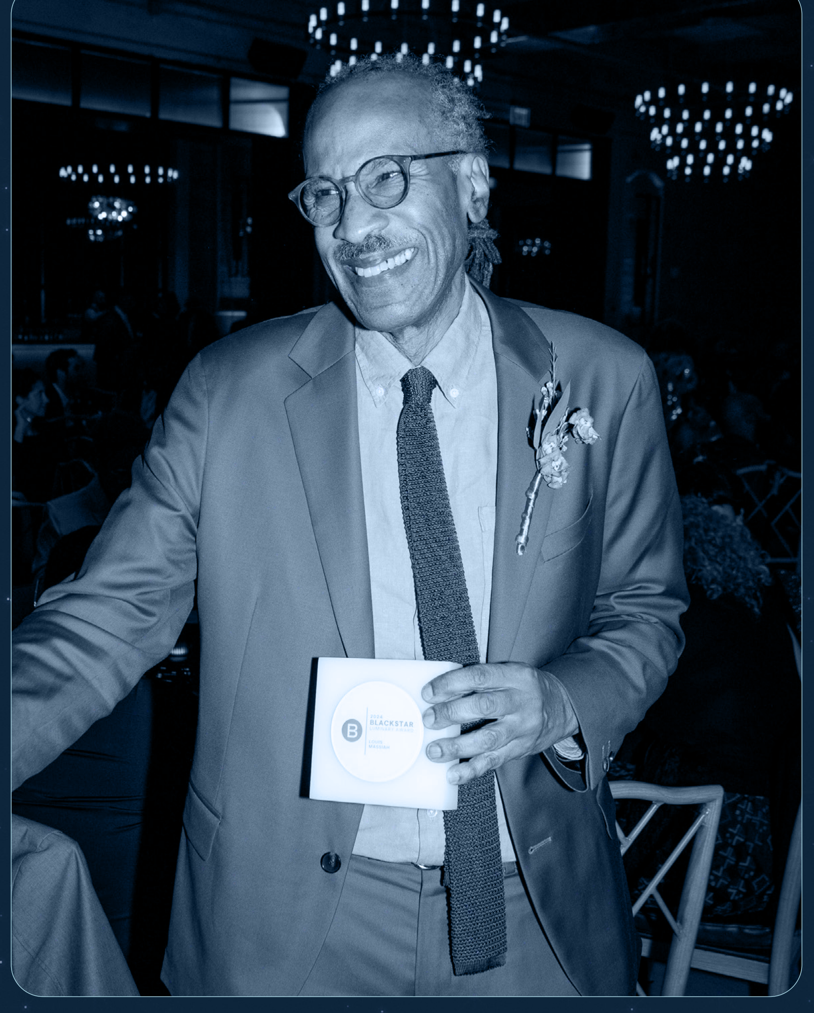
2024 Luminary Gala Honrorees.